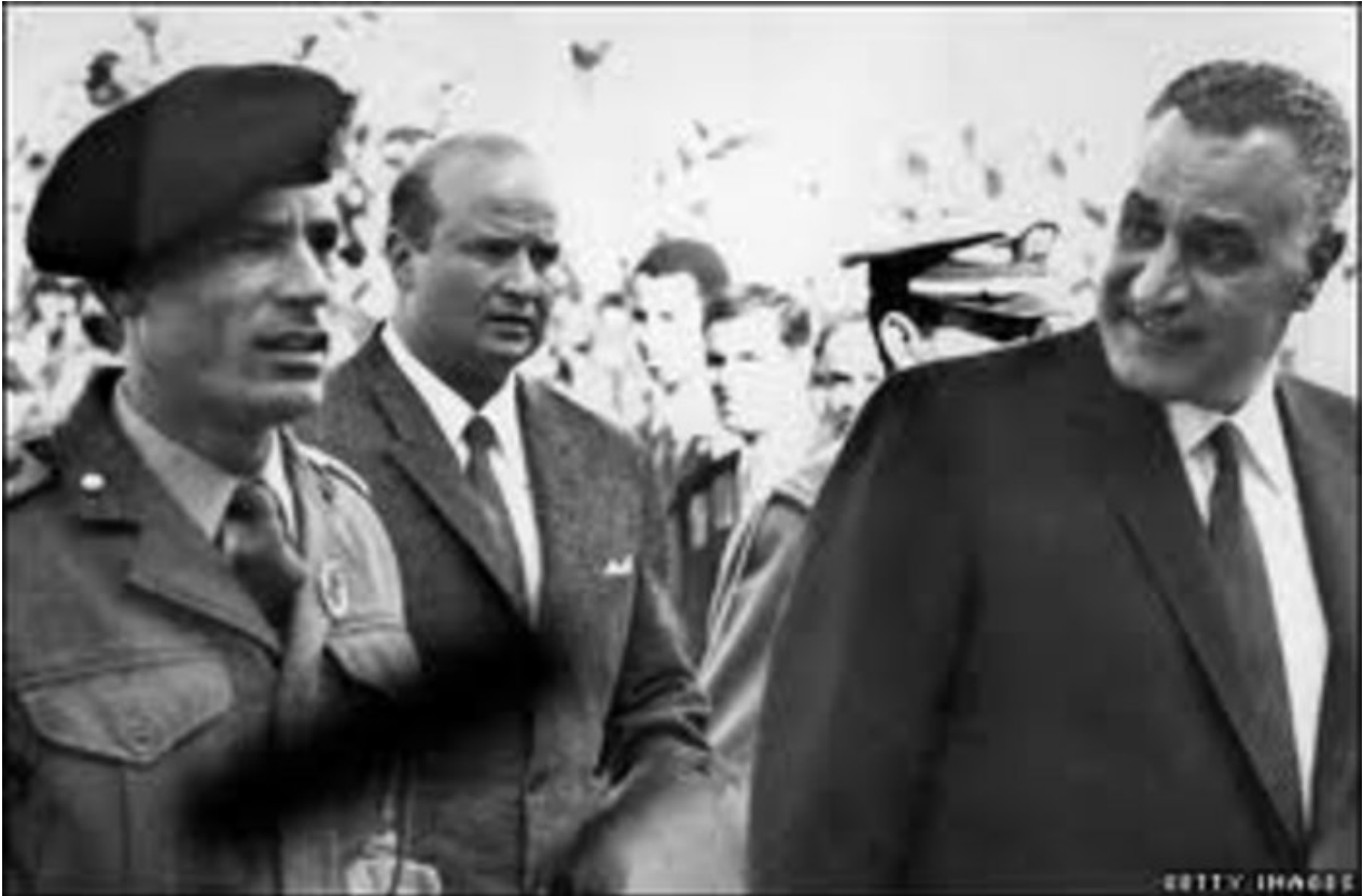
Gaddafi and Nasser in a 1969 Photo.