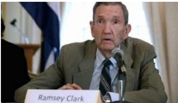
Image on the right: Ramsey Clark was renowned for being a strong advocate in defense of people at disadvantage against the U.S. establishment at home and abroad.

Former US Attorney General Ramsey Clark, son of a Supreme Court Justice understood all this genocidal mayhem as having nothing to do with any American democracy or democratic system: