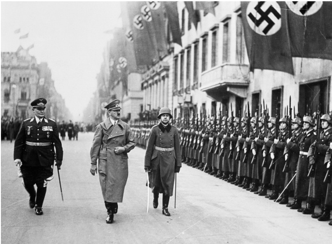
Hitler Returning in Triumph to Berlin After Reunification with Austria

By the late 1930s Hitler had resurrected Germany, which had become newly prosperous under his rule, and he had also managed to reunite it with several separated German populations. As a result, he was widely recognized as one of the most successful and popular leaders in the world , and he hoped to finally settle the Polish border dispute, offering concessions far more generous than any of his democratically-elected Weimar predecessors had ever considered. But Poland's dictatorship instead spent months rejecting his attempts at negotiations and also began brutal mistreatment of its German minority, finally forcing Hitler into declaring war. And as I discussed in 2019 , provoking that war may have been the deliberate goal of certain powerful figures.