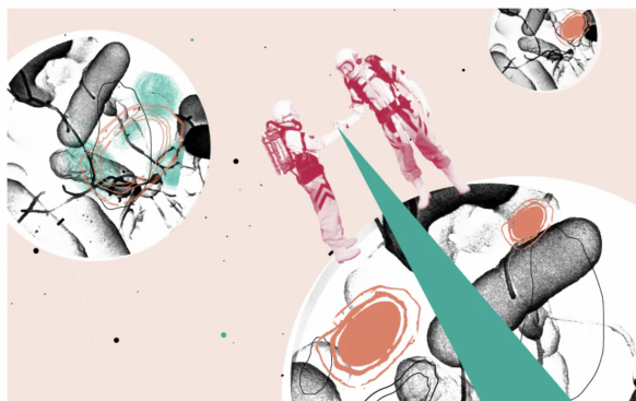
WHO have named Disease X as a disease with pandemic potential