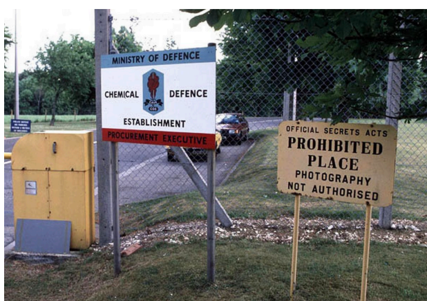
RESTRICTED: Porton Down was founded during the First World War, when chemical weapon use became widespread

The “Disease X” “Vaccine” is to be Developed at the U.K. Ministry of Defense Science and Technology Porter Down Campus