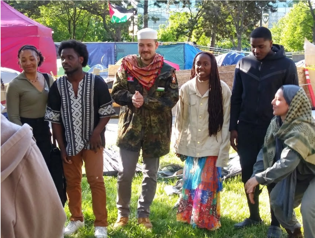
WSU Black Student Union delegation to Palestine solidarity encampment

Later in the evening a tribunal was held at Trinosophes located in Eastern Market. Student activists from the encampment at the University of Michigan and Wayne State University testified to the links between these higher educational institutions and the State of Israel. They also recounted the vicious actions of the police in Ann Arbor and Detroit in tearing down the encampments and filing charges against the Palestine solidarity activists.