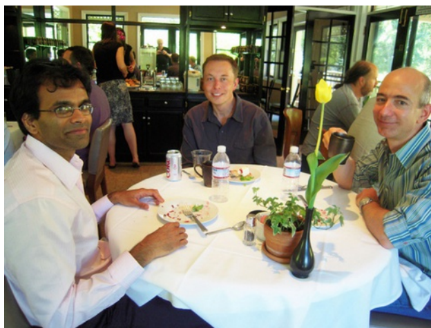
Musk and Bezos attending A Short Course in Behavioral Economics , Edge, 2008

Edge is different from The Invisible College (1646), The Club (1764), The Cambridge Apostles (1820), The Bloomsbury Group (1905), or The Algonquin Roundtable (1919), but it offers the same quality of intellectual adventure.