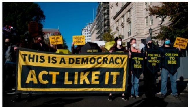
Protesters from the activist group Sunrise Movement march down H Street outside Lafayette Square in Washington, D.C. to express their objection to President Trump's response to the election results on November 5, 2020.

(CNN) — The Sunrise Movement, a youth-led climate activist group, has quickly announced itself as one of the most influential progressive forces in the formative days of President-elect Joe Biden's incoming administration.